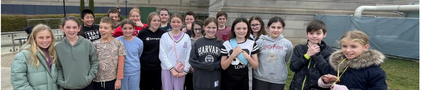
Stage 3 at the War Memorial, Canberra.