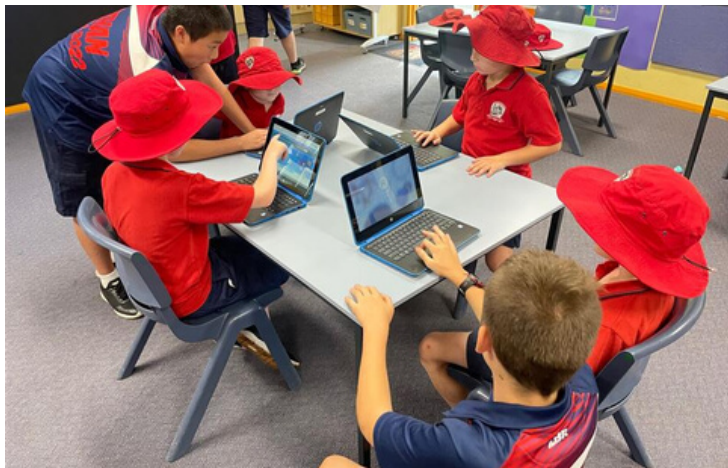
Lunch time Clubs

Our Year 6 leaders have been doing an awesome job running different lunch time clubs for the students to enjoy. Well don Year 6!